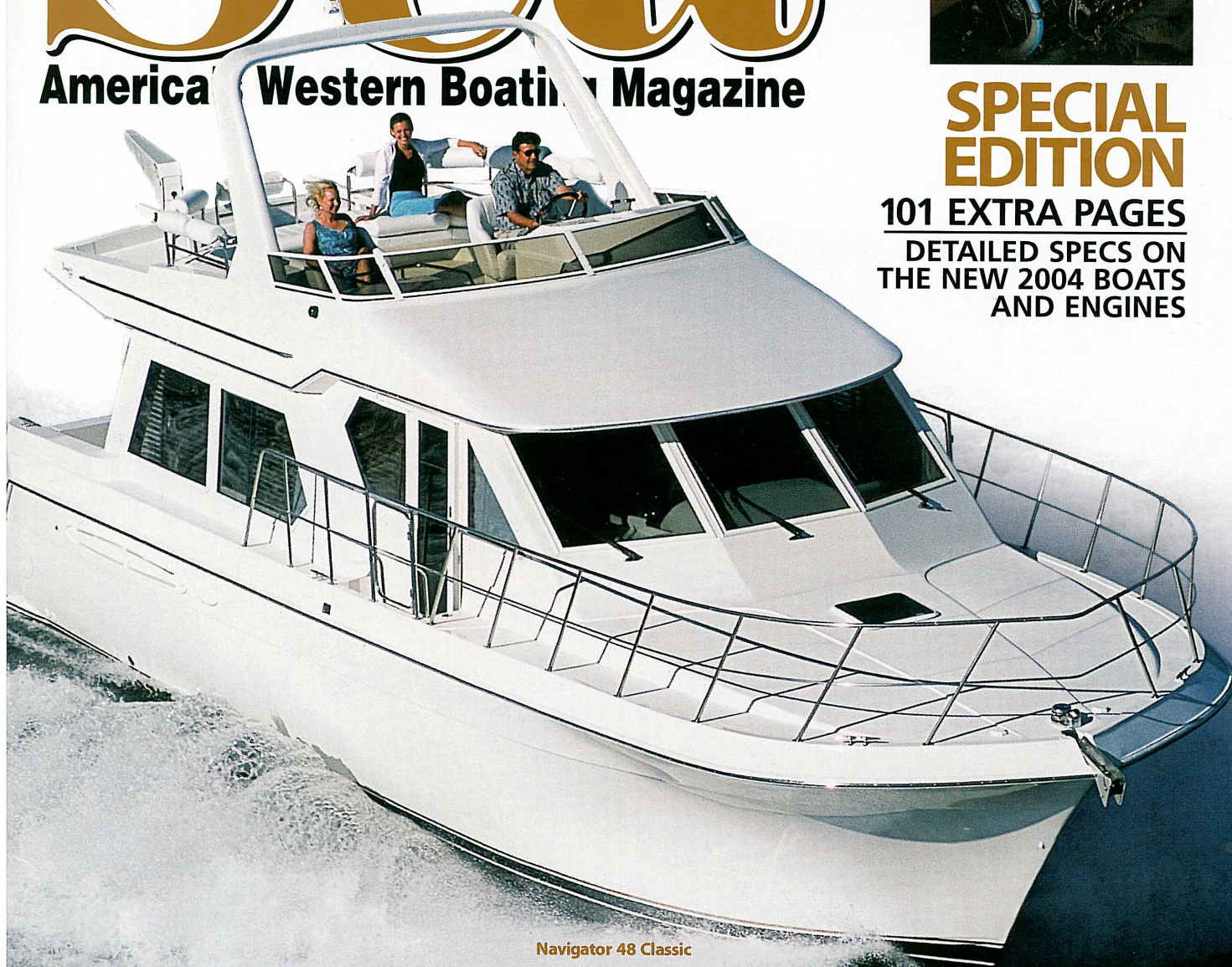
Navigator 48 Classic

DETAILED SPECS ON THE NEW 2004 BOATS AND ENGINES